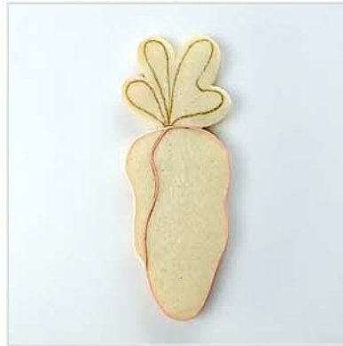
Light Coral PIPING