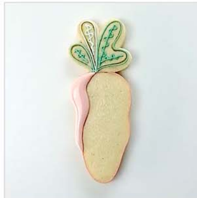
Light Coral FLOOD