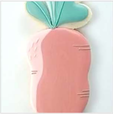
Light Coral PIPING