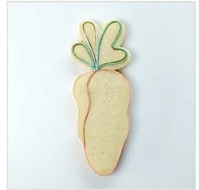
Light Teal &amp; Teal PIPING