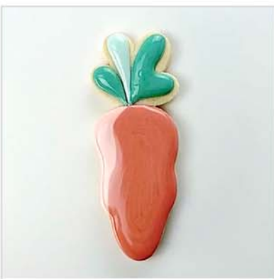
Light Teal &amp; Teal MEDIUM (20sec)