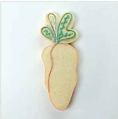
Light Teal &amp; Teal PIPING