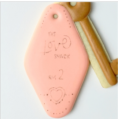
Edible Ink Pen