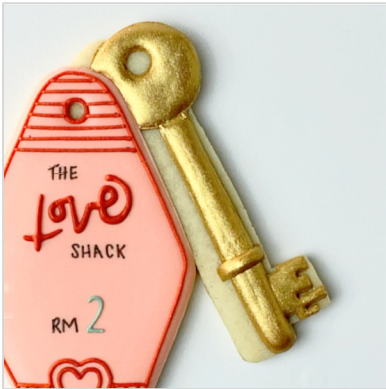
Metallic (gold) paint

22. Making sure the key icing is fully dry, paint over the key. (More details in full video)