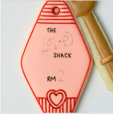
Edible Ink Pen

19. Write the small words shown. The larger word "Love" and the number "2" will be done with piping icing.