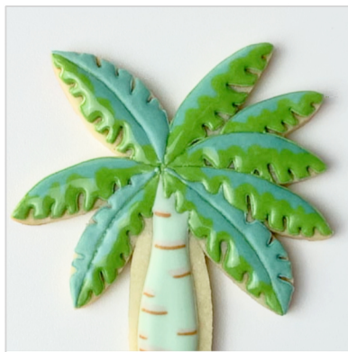
Teal and Green FLOOD

16. With the icing from the prior step still wet, fill in the bottom of the leaf.