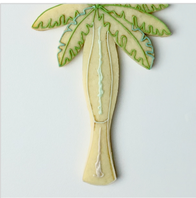
Taupe and Mint PIPING